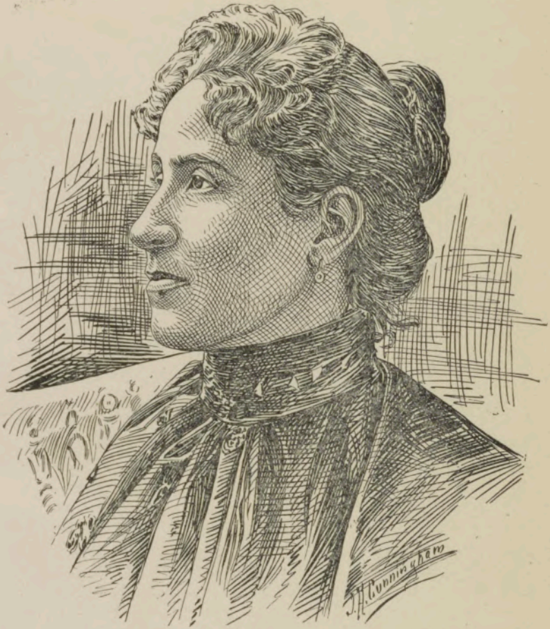
MRS. MARY CHURCH TERRELL. President of the National Association of Colored Women.